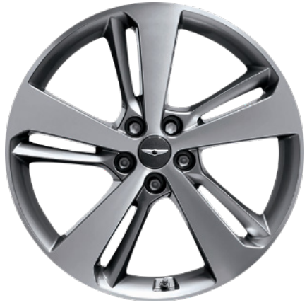
20" Alloy Medium Metallic Grey (Machine-finished) Premium Standard