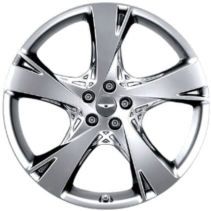
22" Alloy Medium Sputtering Premium Optional Luxury & Luxury Plus Standard