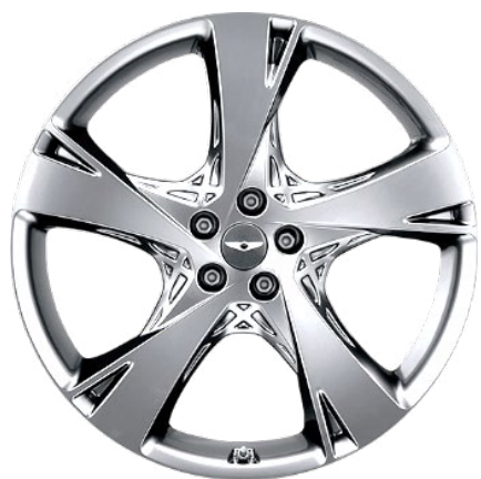
22" Alloy Medium Sputtering Premium Optional Luxury & Luxury Plus Standard