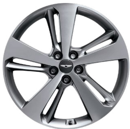
20" Alloy Medium Metallic Grey (Machine-finished) Premium Standard