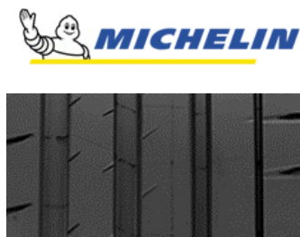
Summer Pilot Sport 4 SUV 265/40 R22