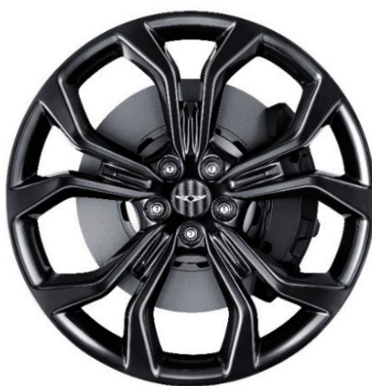
22" Alloy Black Sport Standard