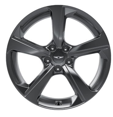
19" Alloy Dark Sputtering Sport Optional